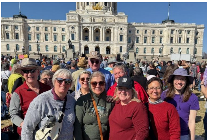
A snapshot of some from Mount Olive who attended the Palm Sunday Faith Action at the capitol this past Sunday, March 29.

For more information about the work of the Lake Street Council, please visit their website at lakestreetcouncil.org .