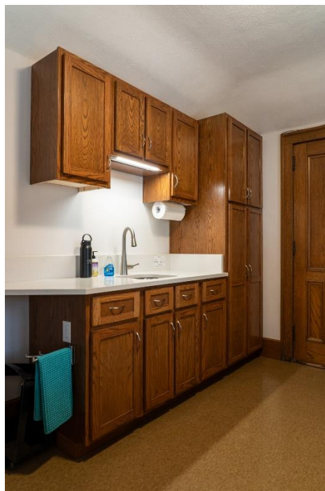
Spacious counters and storage cabinets simplify altar guild duties.