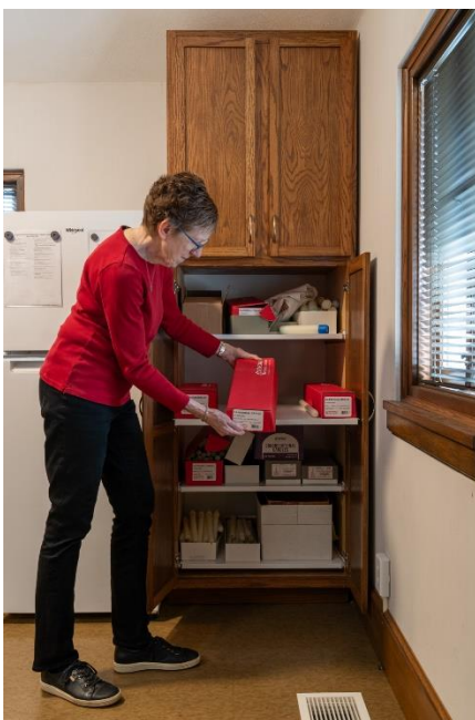
A custom, extra-deep cabinet accommodates extra-long candles.

Altar guild members are grateful to all who contributed to this effort. Stop by and take a peek!