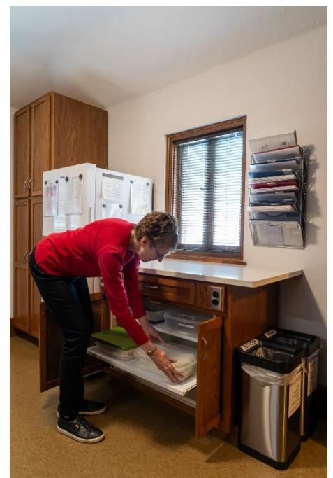
Altar linens are easily accessible from pull-out shelves.